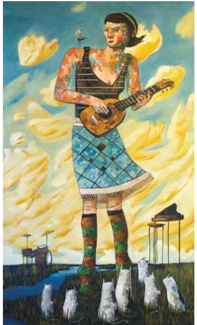
SARAH AND HER SERENADE, OIL ON CANVAS, 60 X 36"