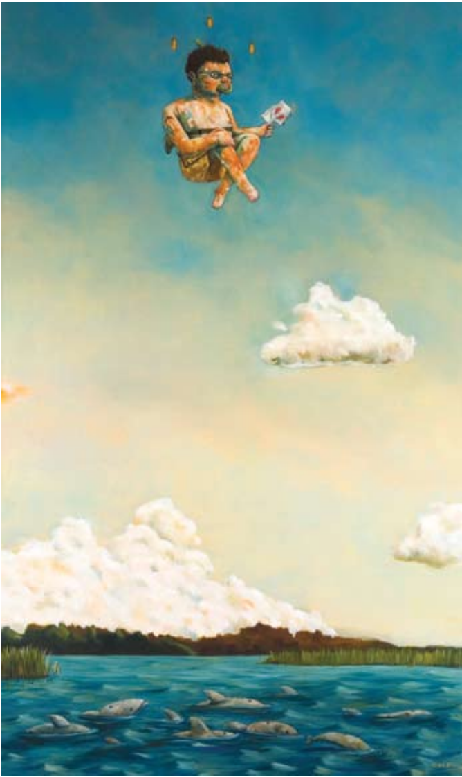
DONIVAN LOOKING FOR ANSWERS, OIL ON CANVAS, 60 X 36"