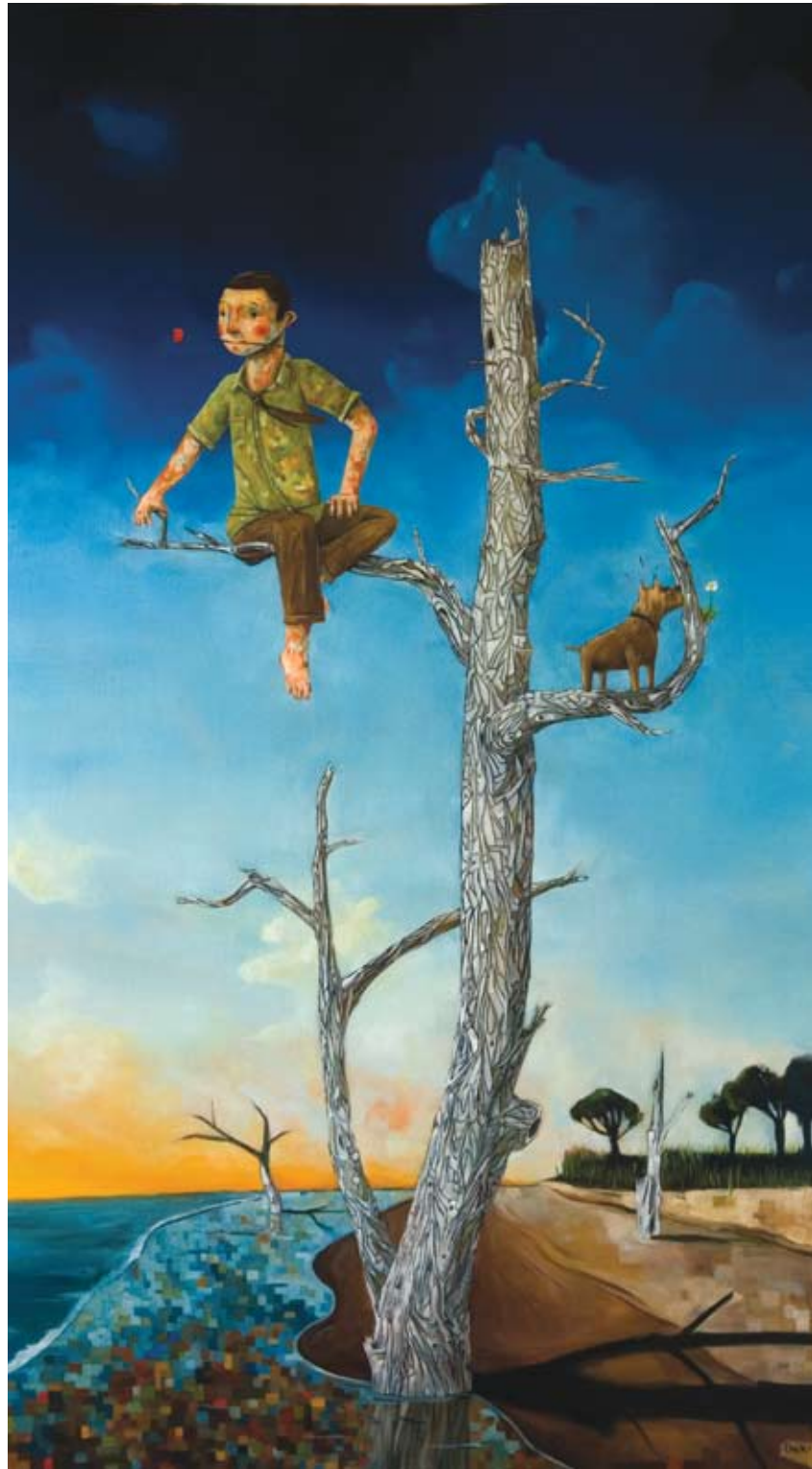
PATRICK WAITING PATIENTLY, OIL ON CANVAS, 60 X 36"